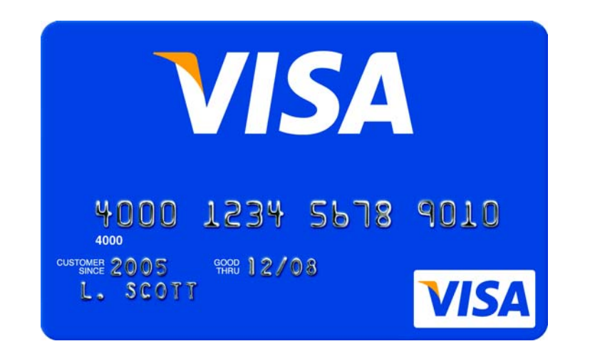
Figure 10A-1 Visa Card