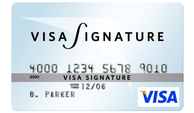
Figure 10A-4 Visa Signature Card-Sample Card Design