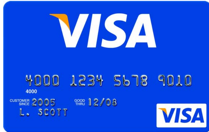
Figure 10A-1 Visa Card